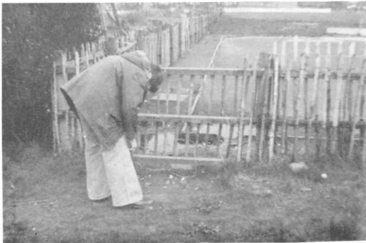
Third appearance here: stance as adopted by "man"