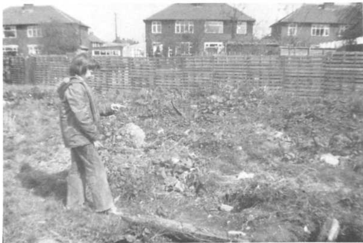
First appearance was here -- near the bushes.

1976). There is also a hollow dipping down to the fence and considerable undulating ground between there and where the children stood (a hundred or so yards away). It is quite conceivable that they mistook his ducking down into the hollow to go under the fence and so into the playground (where the UFO was seen) as the figure "going into the ground."