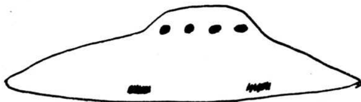
The UFO, as drawn by the witnesses

The children now walked towards the spot where he had been and saw an object rising slowly from the ground, apparently within the playground of the school. It was a medium-sized object shaped like a gently curved disc with a more or less flat bottom. It was silver but had four dark holes (windows?) at the top in a row, and a couple of dark blotches on the bottom in the middle. It rose slowly and then moved horizontally heading South South East to disappear in the direction of Tennyson Road, still quite low.